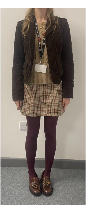
Jacket with trousers, skirt or dress