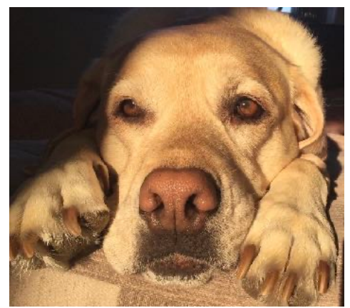
1st Place - Ella Stewart

The theme for this week's Year 9 Photography competition was Mood or Emotion. From the large number of entries we received, it is clear that our pets and walks are helping to boost our mood during lockdown!