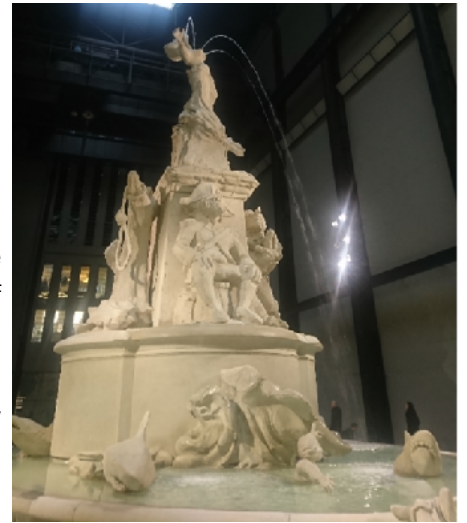
Fons Americanus Kara Walker, 2020