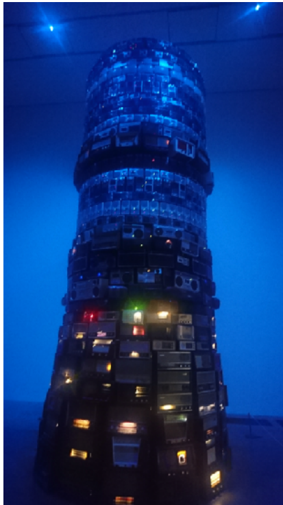
Babel Cildo Meireles, 2001

The Tate stores a cornucopia of works, from Dali to Kruger, each student surely finding many works to fit with each of their chosen themes - as diverse as the gallery's broad selection of art. Seeing well- and lesser-known works filling such a huge building was a sight to behold. Many were overwhelmed by the scale and concept of the pieces.