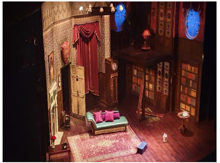
Set for The Play That Goes Wrong