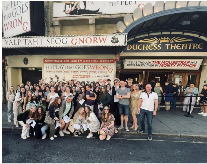
The group outside the Duchess Theatre

That evening, we ate at Byron Burger before visiting the Duchess Theatre to see the long-running comedy The Play That Goes Wrong . Again, a packed house witnessed superb performances, this time with farce, slapstick and visual gags. Over two nights, our students had seen some fabulous performance work in completely different genres.