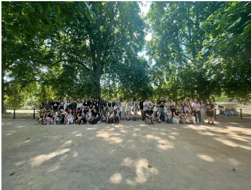
The group in St James' Park