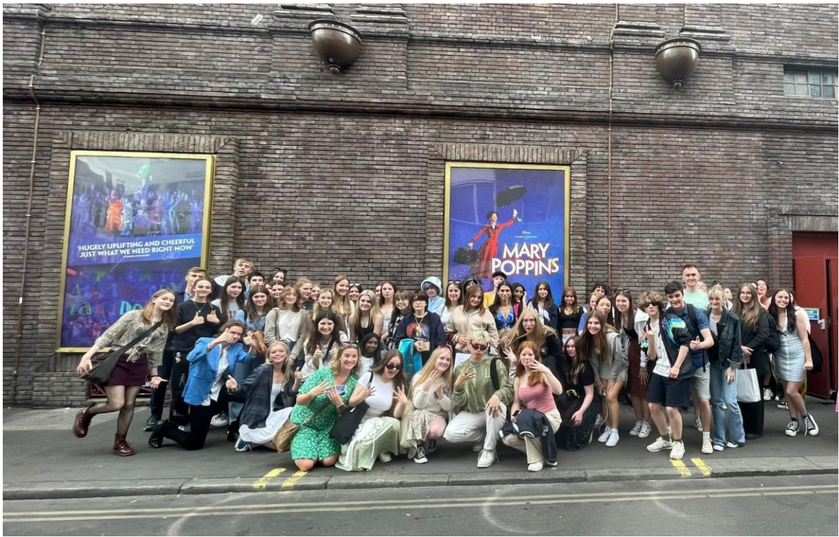
The group outside the Prince Edward Theatre