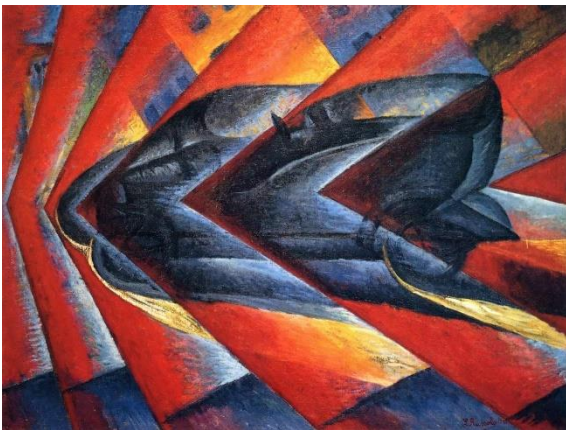
Luigi Russolo, Dynamism of a Car, 1912