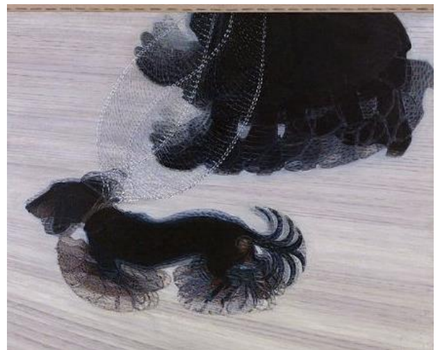
Giacomo Balla, Dynamism of a Dog on a Leash, 1912