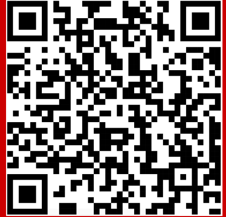
Current BGS Student