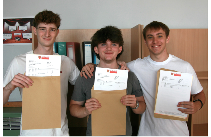
2025 A-Level Results Day