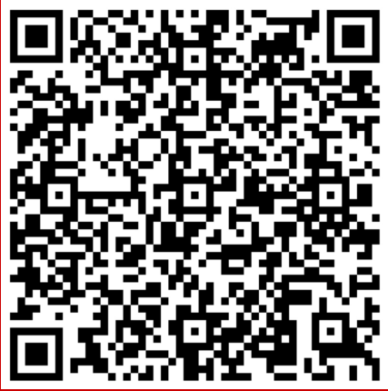
New to BGS