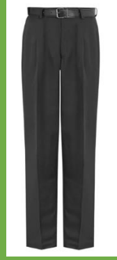
Plain black belt/ loose fit/ straight fit