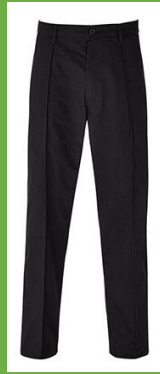
Mid Waist/ Standard fit