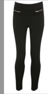
Zips/ Skinny fit/ Tight fit