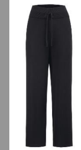
Jersey/ Tracksuit/ Stretch