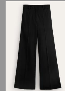
Flared/ Wide bottomed