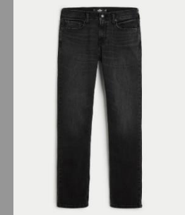
Jeans / rivets